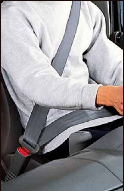
Three-point ELR seatbelts (Option) Automatically activated to grip firmly in case of sudden stops or collisions.