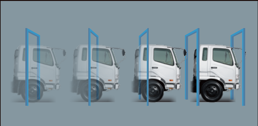
Quality gates No Mitsubishi FUSO truck is delivered to customers without first passing through 11 quality validation gates that are integral parts of the FUSO Product Development System.