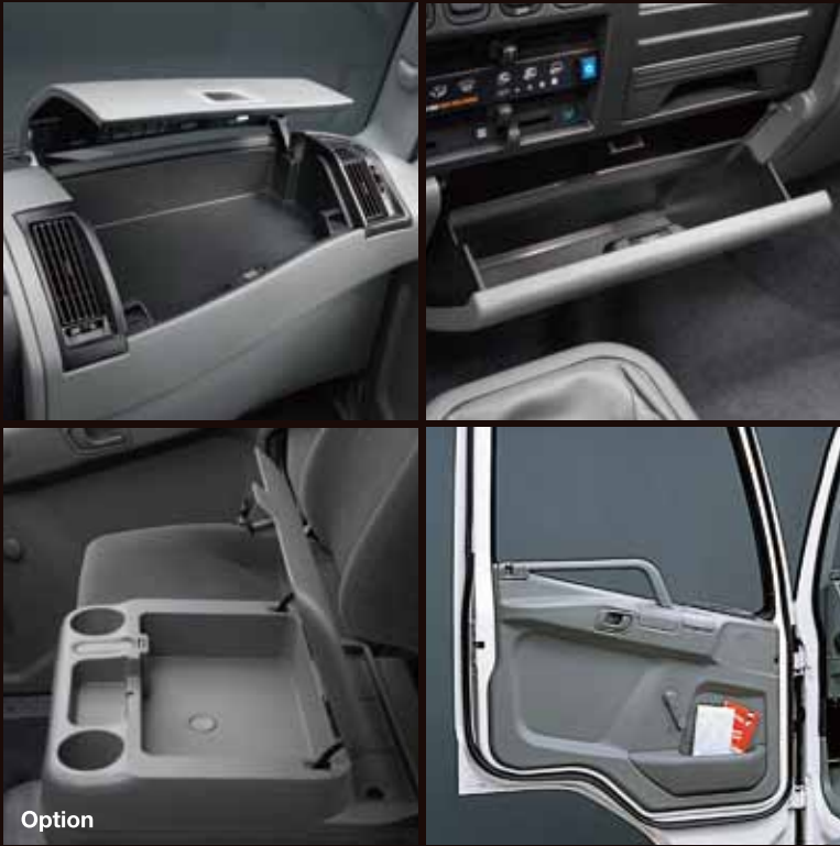
Lots of convenient storage No more distracted driving while reaching at awkward angles.