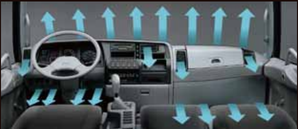
Better distributed air conditioning More and more widely distributed vents eliminate hot and cold spots.