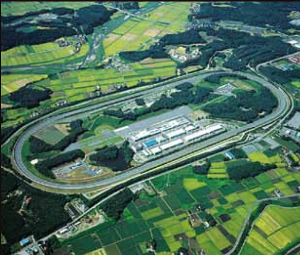
Ready to meet any test Mitsubishi FUSO vehicle designs are rigorously tested, on the road as well as on our state-of-the art test track.