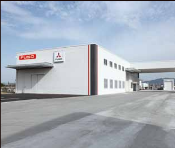
Here when you need us Mitsubishi FUSO dealers are staffed with highly qualified technicians.