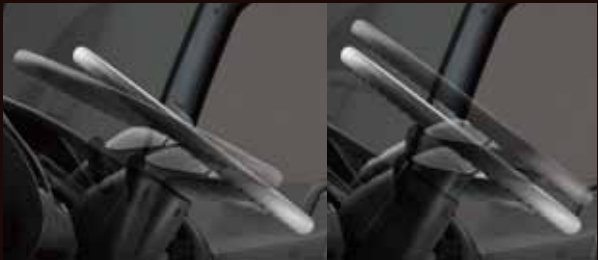
Tilttable, telescoping steering wheel Easy to adjust to the distance and angle most comfortable for the driver.

Is this a truck, or a passenger car? It's a truck with the comfort and amenities you expect from a passenger car. Why? Because a driver who can comfortably see more of the road around him and remains fresher and more alert can drive more safely. Ensuring delivery, which is better for business. And lowering the frequency of accidents, which is good for everybody.